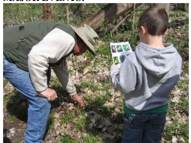
Elkhart Historical Society Events

The Elkhart Historical Society sponsors annual Wildflower Nature Walks, Birding Walks, and historical hill tours. Everyone on the Wildflower Nature Walks receives a wildflower "bingo" card to learn the names of the flowers and to keep track of the beautiful wildflowers they see on Elkhart Hill. The Society has a tour wagon for visitors attending events. The Elkhart Historical Society (EHS) sponsors dinner/lectures in the fall and spring in historic downtown Elkhart. The Society also sponsors the annual Christmas Chapel Service and coordinates it with the Christmas activities of the village.