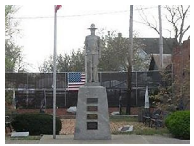
Veterans' Memorial Park

Located in historic downtown Elkhart on Governor Oglesby Street, the park displays a doughboy statue that was presented to the Village by the returning veterans of World War I in honor of the men who did not return from that war. Since then, plaques have been added to the statue with the names of Village veterans from WWII, the Korean War and all veterans killed in action from Elkhart during all past wars.