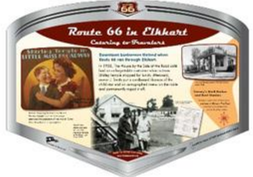
Elkhart Illinois Route 66 Interpretive Statue & Wayside Exhibit

The Village of Elkhart Historic Rt. 66 Statue and Wayside Exhibit is located to the west of Elkhart's Village Hall and compliments the Village's ongoing initiative to make Elkhart a special stop for Illinois Route 66 Scenic Byway tourists. As one of nine Illinois Route 66 communities receiving the new series of interpretive statues and corresponding wayside panels, the exhibit is part of a grant program through the Federal Highway Administration's National Scenic Byway Program and the Illinois Office of Tourism. Elkhart's theme is 1930-1940s restaurants and gas stations in Elkhart on old Rt. 66. The exhibit focuses on Shirley Temple's stop at The House by the Side of the Road restaurant in 1938 and the Shell Station and roof top garden.