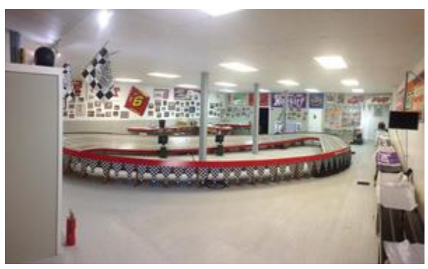
Rt. 66 Model Raceway 109 Governor Oglesby Street

You don't have to know anything about slot car racing, they will help you and you'll have fun! 1/24th 1/32nd scale slot car racing tri oval. Red bull short track oval 1/8 mile scale drag track rental time fully stocked parts cars for sale. If you want to spend some time with your children, and teach them about physics, hand-eye coordination and sportsmanship - this is a place. AND ... there is a good chunk of time when it's the adults turn to practice and race.