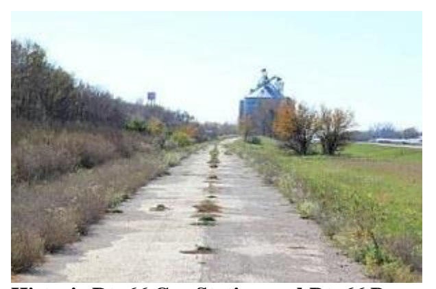
Historic Rt. 66 Gas Station and Rt. 66 Bypass

Elkhart's unique and historic gas station with it's rounded design, stood abandoned for years until recently, when it was purchased by Elkhart Grain Company for office use. Elkhart also has an early Route 66 bypass nearby. The legend goes that the village was not willing to pave Route 66 through the community, and so it was paved around it. North fo the grain elevator, next to the railroad tracks, is another early section of abandoned Route 66.