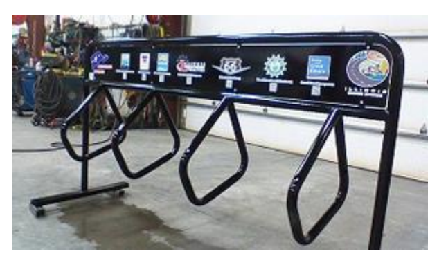
Illinois Route 66 Bike Trail

Elkhart is on the Bike Route 66 Trail Route. The route goes directly past historic downtown Elkhart or takes an alternate route through Elkhart along the back roads to the next stop south in Williamsville. Bike Route 66 signs are posted throughout Elkhart for bicyclers. An Illinois Route 66 Heritage Project special edition bicycle rack is located in the west corner of the Village parking lot by Elkhart's Heritage Corner exhibit. The custom bike rack was provided by the Illinois National Scenic Byway's FHWA grant as part of the Bike Rack Project for Illinois' seven National Scenic Byways.