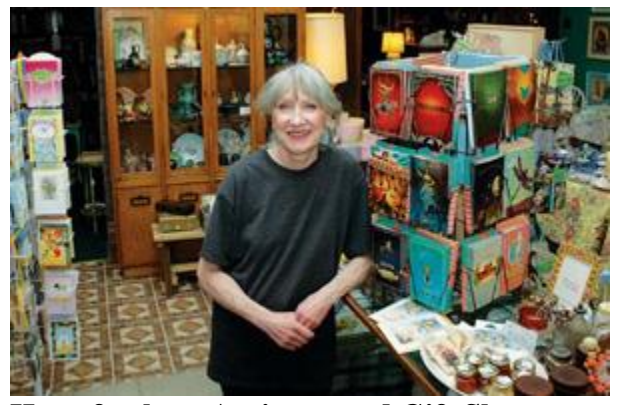
Horsefeathers Antiques and Gift Shop