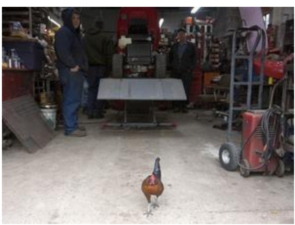
Richardson Repair 112 Governor Oglesby Street

The Little Foxes shop sells Amish noodles and jellies and other specialty foods. The shop is located in the original 1889 building that at one time housed the Brennan's Store and later Lanterman's Store. The original storefront of the building has been restored. The side of the building still shows some of the advertisement for shoes painted on the brick many years ago. Little Foxes Official Website